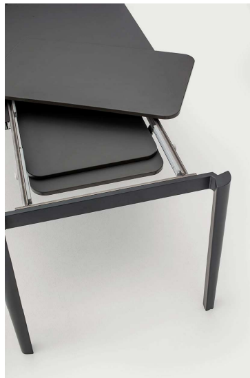
Beta A Table